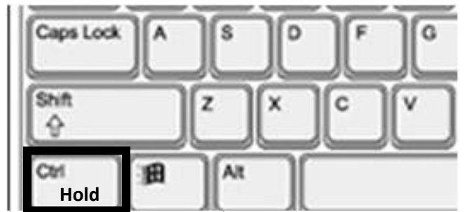
Ctrl - Left Mouse Click To progressively select only what you click on