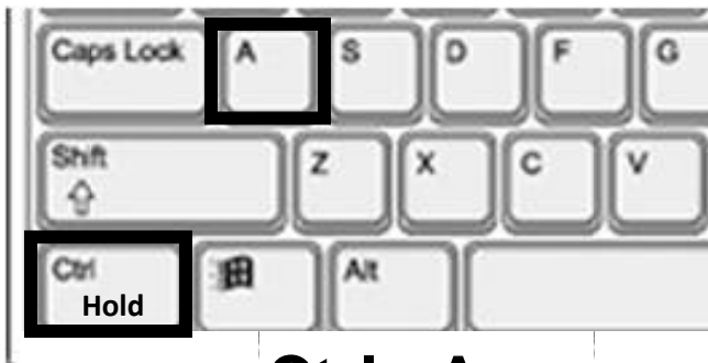
Ctrl - A Select All